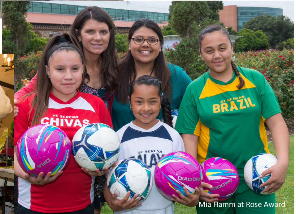
Mia Hamm at Rose Award