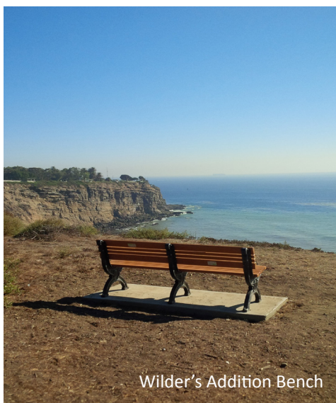
Wilder's Addition Bench