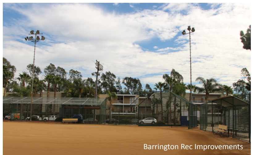
Barrington Rec Improvements