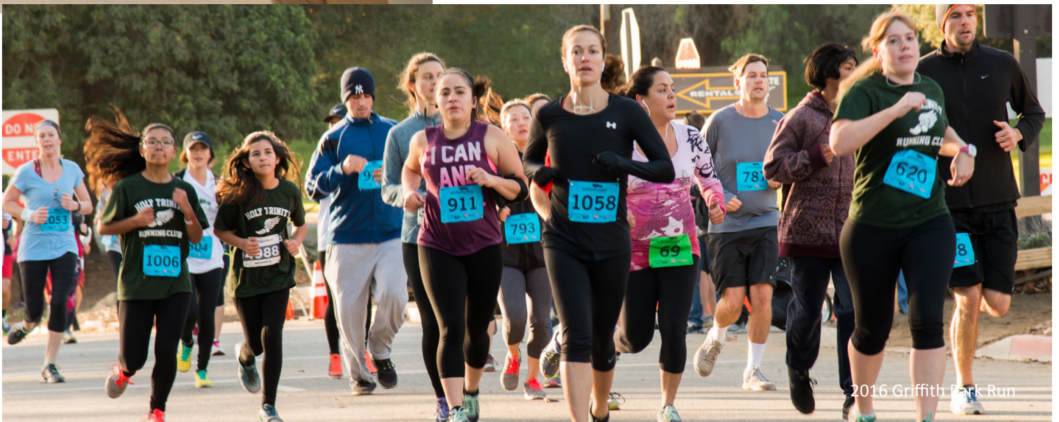
2016 Griffith Park Run