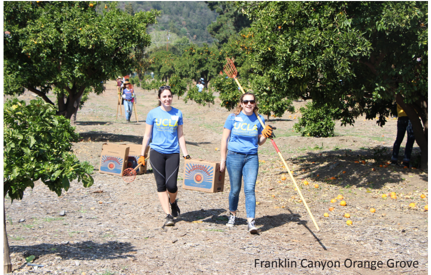
Franklin Canyon Orange Grove