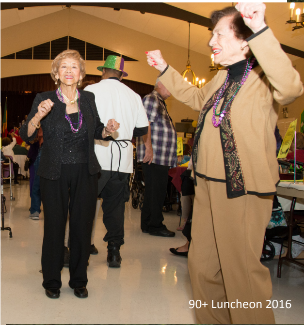
90+ Luncheon 2016