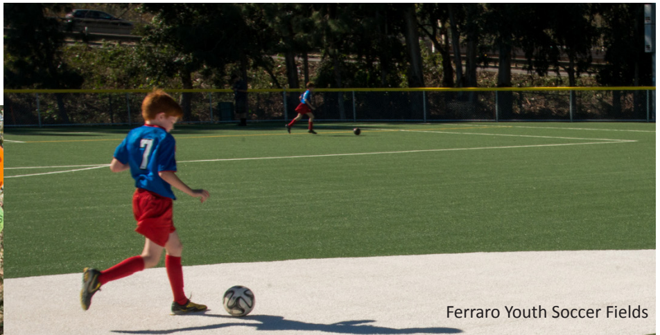
Ferraro Youth Soccer Fields