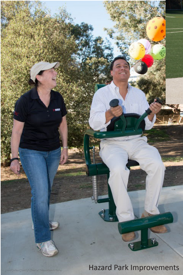
Hazard Park Improvements