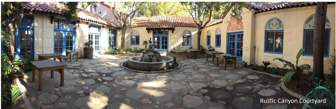
Rustic Canyon Courtyard

Donate-A-Bench: Park benches provide rest and reflection. Through the Los Angeles Parks Foundation Donate-A-Bench individuals and businesses have added benches all over LA City.